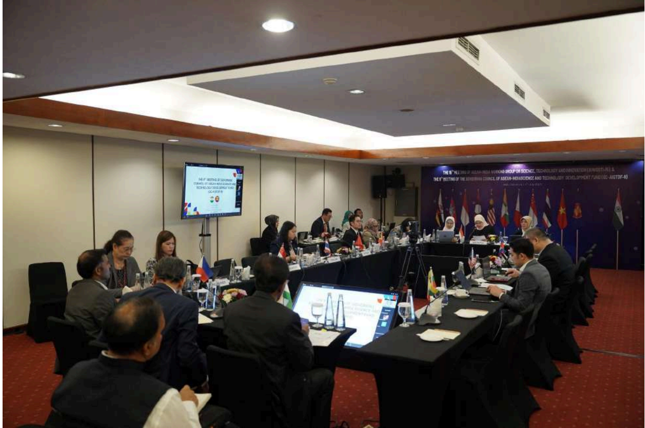
The 15th ASEAN–India Working Group on Science, Technology, and Innovation (AIWGSTI-15) at The ASEAN–India ScaleHub 2025