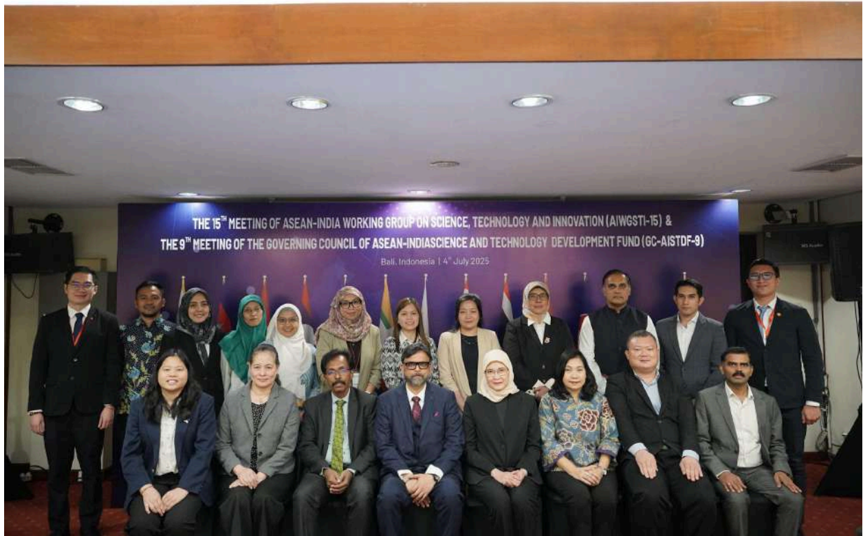
The 9th Governing Council Meeting of the ASEAN–India Science & Technology Development Fund (GC-AISTDF-9) at The ASEAN–India ScaleHub 2025

A vital feature of the event was the concurrent hosting of the 15th ASEAN–India Working Group on Science, Technology, and Innovation (AIWGSTI-15) and the 9th Governing Council Meeting of the ASEAN–India Science & Technology Development Fund (GC-AISTDF-9). These high-level meetings brought together senior officials and technical experts to advance joint R&D initiatives, define co-investment priorities, and strengthen frameworks for knowledge transfer and capacity building. Discussions ranged from digital transformation and green innovation to frameworks for intellectual property rights and gender-inclusive entrepreneurship, cementing the region’s commitment to shared prosperity and resilience.