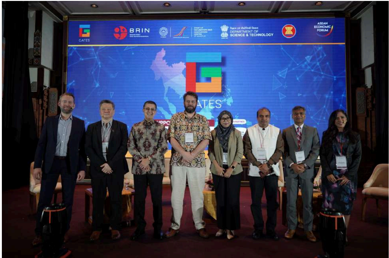
Panel discussion titled “Decentralised AI: AI at the Edge, Power at the Core” at The ASEAN–India ScaleHub 2025