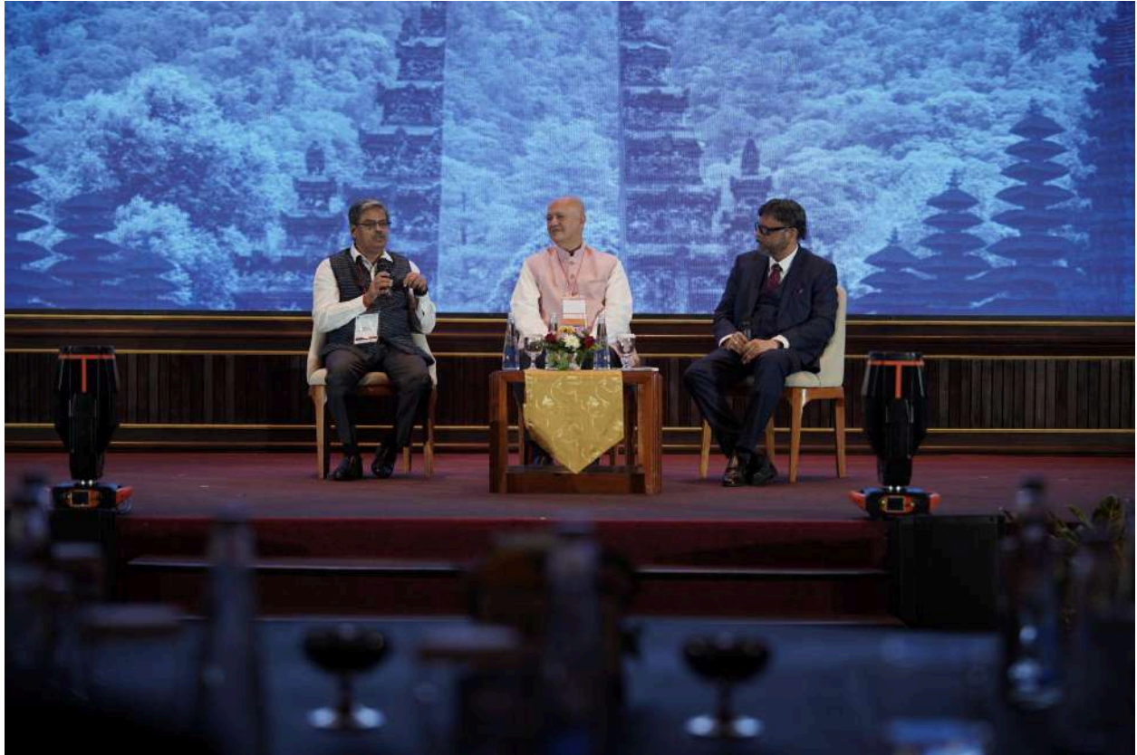
Fireside chat session at the The ASEAN–India ScaleHub 2025