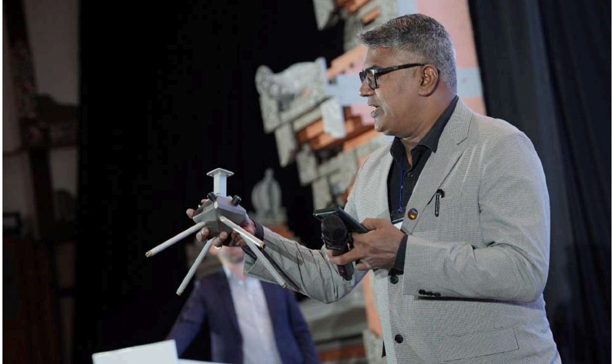
Smart Pitch session at The ASEAN–India ScaleHub 2025