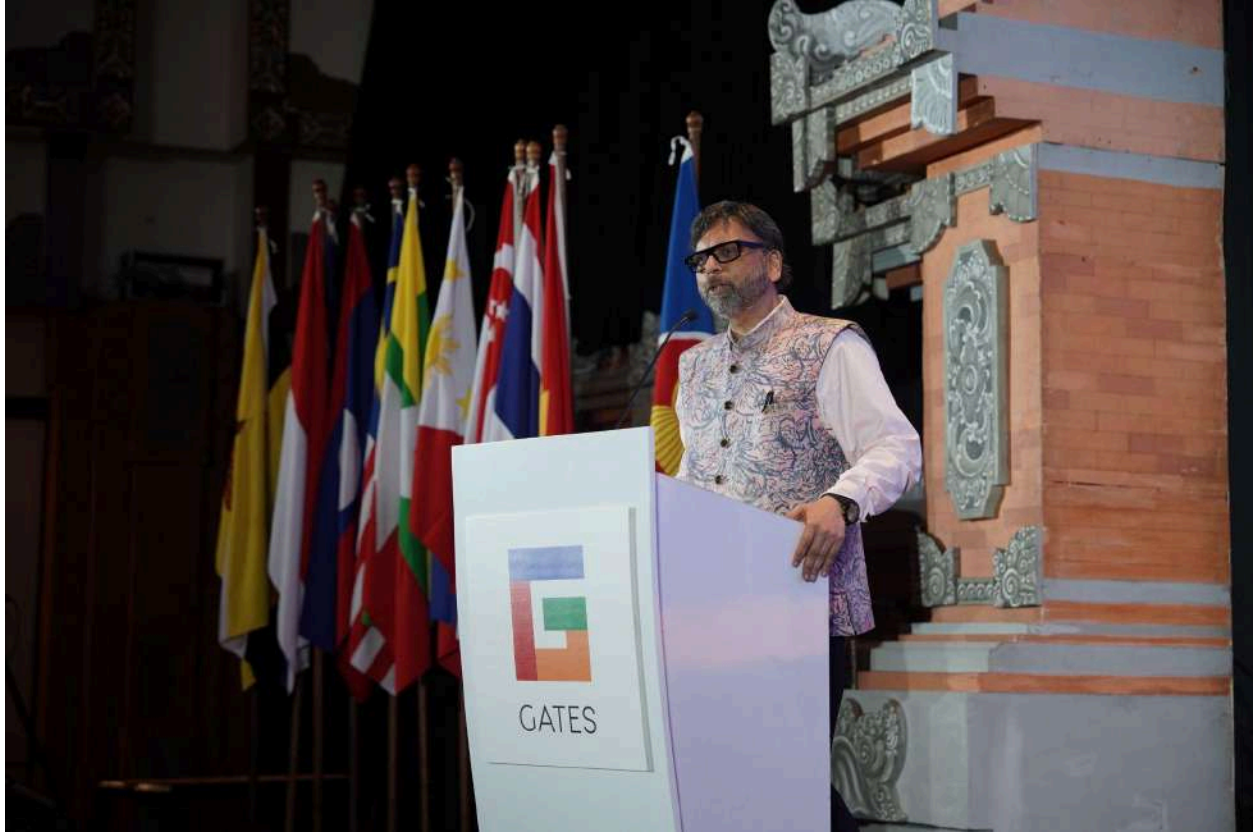
Jayant N. Khobragade, India's Ambassador to ASEAN

Jayant N. Khobragade, India's Ambassador to ASEAN, reinforced this message by spotlighting India's dramatic journey from 350 startups in 2014 to over 180,000 in 2024, including 118 unicorns.